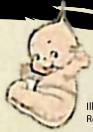
Illustration: Rose O'Neill

Women have been making comics successfully since the early 20th century. Their comics in every genre from journalism to autobiography have helped elevate comic art to a major genre with its own well-developed critical practice. This presentation will introduce us to the history and significance of women's production in this medium.