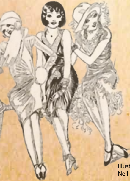
Illustration: Nell Brinkley

All presentations 10 am-11:30 am Malaspina Theatre | Building 310